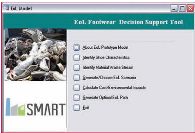
End-of-Life footwear decision support tool.