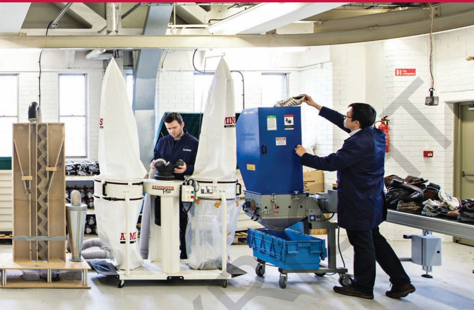
Footwear recycling line at the Centre for SMART.