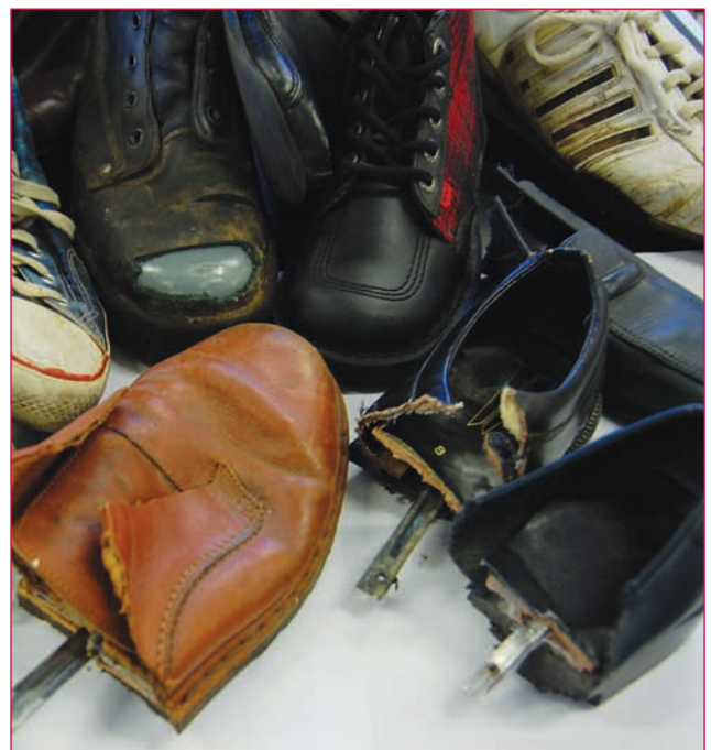
Typical metallic items found in footwear. Steel shanks moulded into soles are particularly difficult to extract.